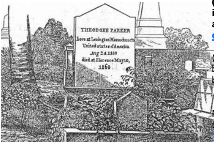
Parker's grave at the English Cemetery in Florence. His American admirers replaced this simple marker with a more elaborate one in the late 19th century.

Parker's health began to fail in 1857. In January 1859, he suffered a physical collapse, brought about by tuberculosis, which ended his preaching career. In February, he left wintry Boston with his wife and others for the warmth of the Caribbean. While on the island of Santa Cruz in March and April, he wrote a long, autobiographical letter to his congregation that was also a confession of faith. It soon was published as Theodore Parker's Experience as a Minister . Parker then traveled to England, Switzerland, and Italy. His condition worsened in the winter of 1859, and he died on 10 May 1860, in Florence.