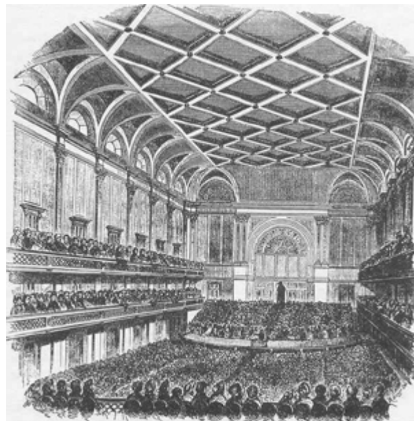
Theodore Parker preaching at the Boston Music Hall

In January 1845, Parker accepted the invitation of some supporters to preach regularly in Boston. They rented the Melodeon Theater, and he delivered his first sermon there in February, to a large audience. Over the following year, he preached in the morning at the Melodeon and in the afternoon at West Roxbury. In December 1845, Parker's supporters organized the 28th Congregational Society of Boston. He was installed as its minister in January 1846, his isolation from his colleagues symbolized by his preaching his own installation sermon ( The True Idea of a Christian Church ). He resigned his West Roxbury pulpit the following month.