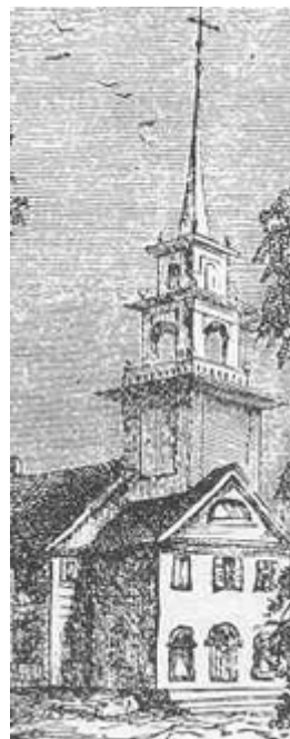
West Roxbury Church

At Harvard, Parker read voraciously, became an assistant instructor in Hebrew and, for a time taught himself to read a new language every month; by 1836, he claimed a reading knowledge of "twenty tongues." Among his many extracurricular activities, he edited the Scriptural Interpreter , a student journal of biblical criticism, and published many small articles in the Unitarian weekly, the Christian Register .