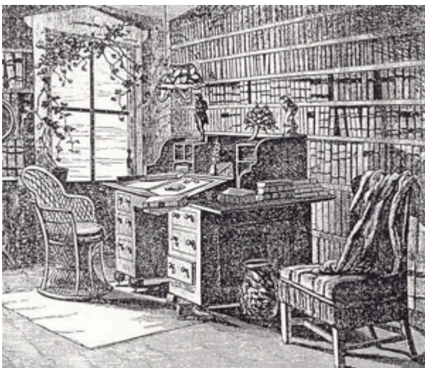
Parker's study at the time of his death. On his desk are a bust of Jesus and a statue of the Roman slave rebel Spartacus.